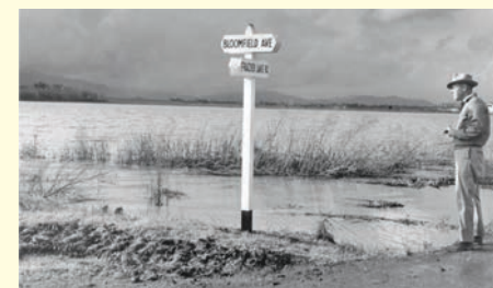
Pajaro River Agricultural Preserve almost entirely under water during 1955 flood.

The Authority foresees restoring portions of the property along the Pajaro River to enhance habitat for nesting birds, improve water quality, and improve the habitat linkage along Llagas Creek and the Upper Pajaro between the Santa Cruz Mountains and Diablo Range. The Authority intends to keep the land in active farm production by leasing to a farmer.