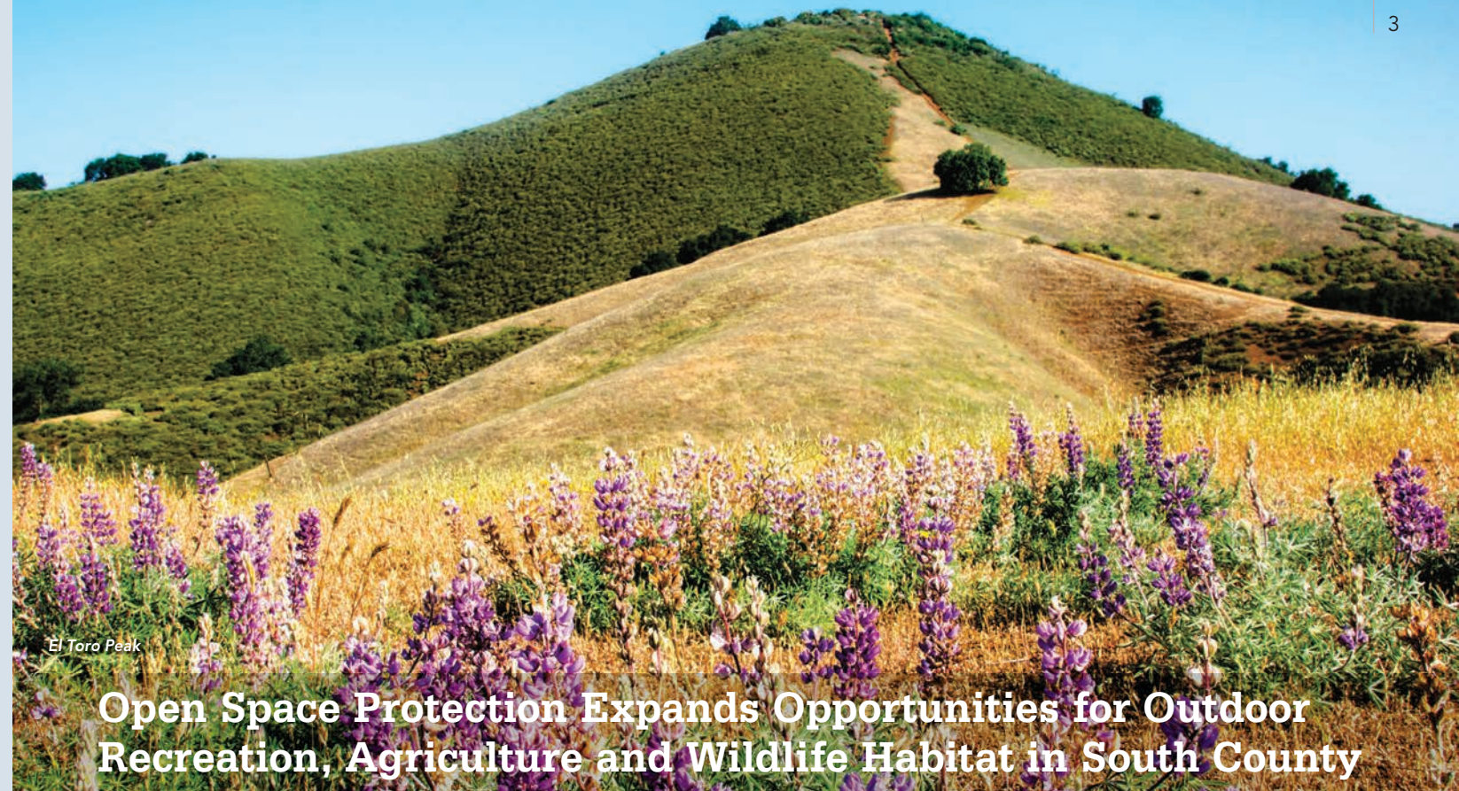
El Toro Peak

yard. An elderberry tree may take time to grow but both the purple fruit and white flower can be eaten. The syrup of elderberry is a folk remedy for flu symptoms. The large red fruit of the prickly pear and the pokey paddles make for “superfoods.” The juice from the fruit is used in jelly and cocktails or vinaigrette.