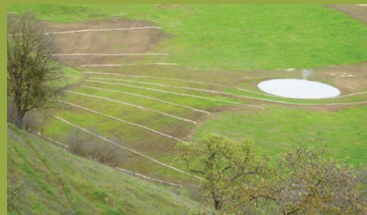
Coyote Valley Open Space Preserve - South Meadow Restoration Project

The Coyote Valley, a 7,500 acre natural and agricultural landscape between south San Jose and Morgan Hill contains the Laguna Seca, the largest freshwater marsh remaining in the South Bay. But this area was anything but dry ("Seca") during the 2016-2017 storms. As pictured above, this winter it filled for the first time in years, attracting birds and wildlife and reminding us of nature at our doorstep and what the area looked like over 100 years ago.